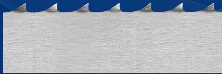
Maßstab / Scale 1:1