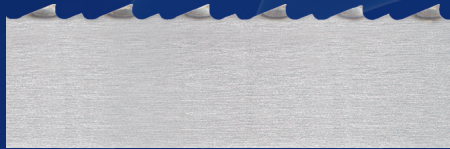
Maßstab / Scale 1:1